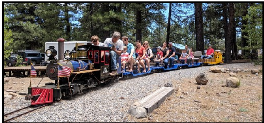
Truckee River Railroad, 2018